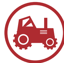
Farming and agriculture