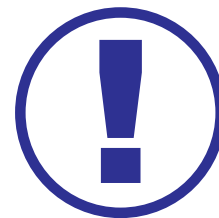
Safety & wellbeing

Do you have any specific comments on any of the policies outlined?