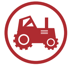
Farming and agriculture

Do you have any specific comments on any of the policies outlined?