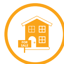
Affordable & social