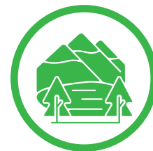
Flora and fauna