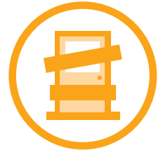
Derelict & empty